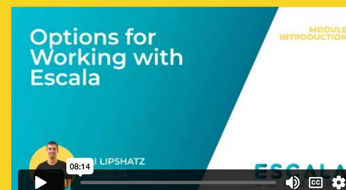
Options for Working with Escala