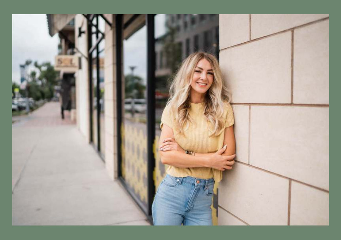
BONUS CONTENT Learn how to set up your LLC, how to legally take advantage of tax benefits and write

Learn from other top 7- and 8-figure entrepreneurs. Hear their story, how they started, and their top tips for beginners.