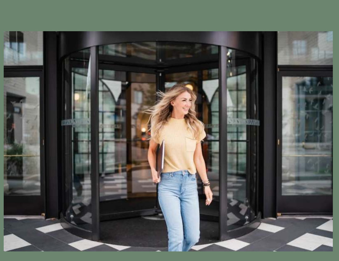
MODULE #2 Build and optimize your online storefront.